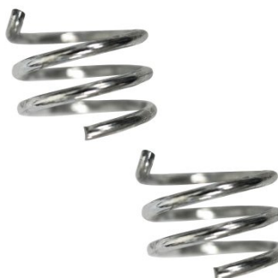
W554 2 x Shroud Springs