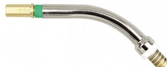
W562A Swan Neck Assembly