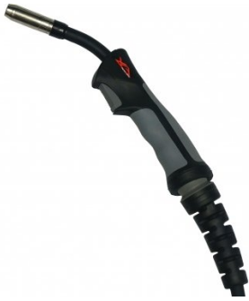
W542A MIG Torch - 3 Metre