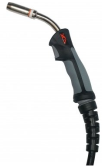
W559 MIG Torch - 4 Metre