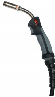
W559A MIG Torch - 3 Metre