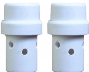
W576 2 x Gas Diffusers