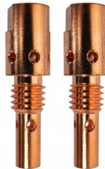
W562 2 x Contact Tip Holders