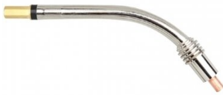
W568 Swan Neck Assembly