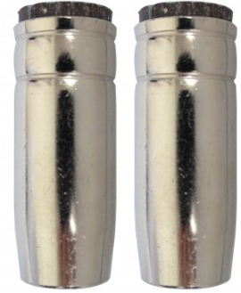
W560 2 x Conical Nozzles