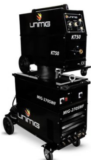
W249 MIG WELDER