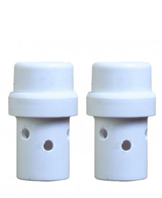
W576 2 x Gas Diffusers