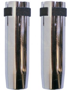
W564 2 x Conical Nozzles