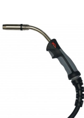
W571 MIG Torch - 4 Metre