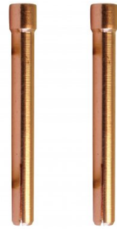
W593 2 x 2.4mm Collets