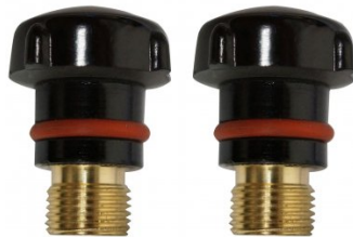
W589 2 x Short Back Caps