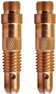
W586 2 x 1.6mm Collet Holders