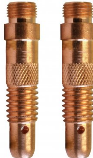
W586 2 x 1.6mm Collet Holders