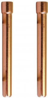
W585 2 x 1.6mm Collets