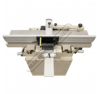
Rear Top View