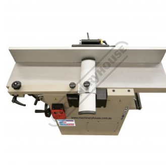
Front Top View