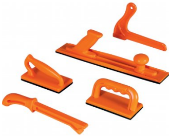
W309 Safety Push Blocks & Stick Set