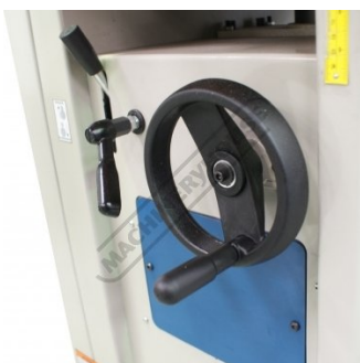
Table Height Adjustment Handle