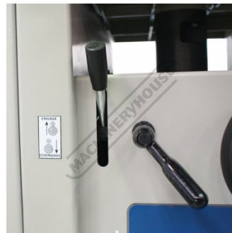
Feed Engage Levers