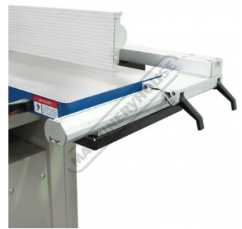
Adjustable Double Lock Fence