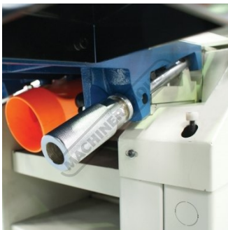
Table Height Adjustment