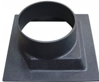
W339 Dust Hose Floor Sweeper Attachment