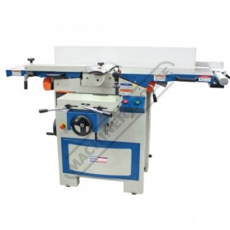
Shown with Optional PT300 Mortising Attachment (W615)