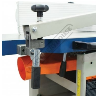
Blade Guard Tension