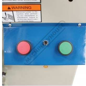
On Off Buttons