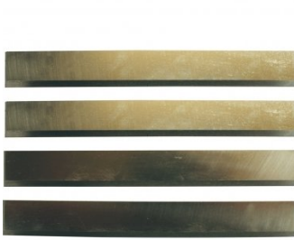
3TJ0202A BLADES PKT 4