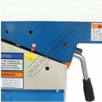
Table Height Gauge