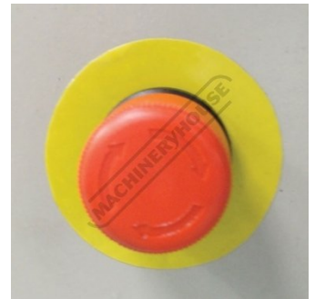
Safety Stop Switch