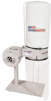
W332 Dust Collector