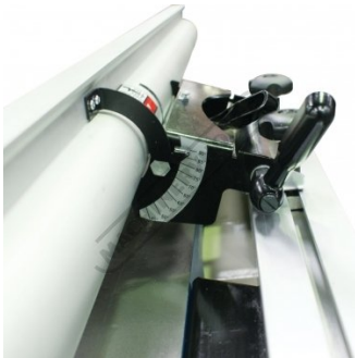
Adjustable Tilting Fence