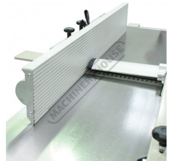
Aluminium Extrusion Fence