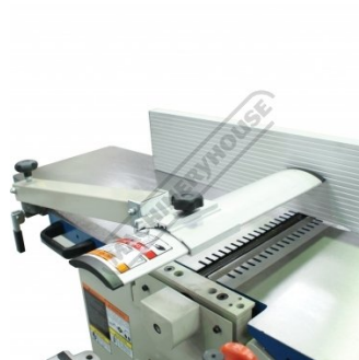
Adjustable Blade Guard