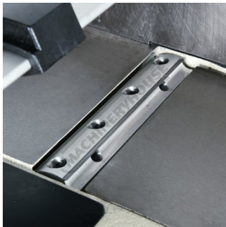
2 Blade Cutter Head