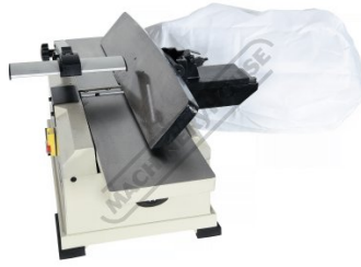
Adjustable Tilting Fence