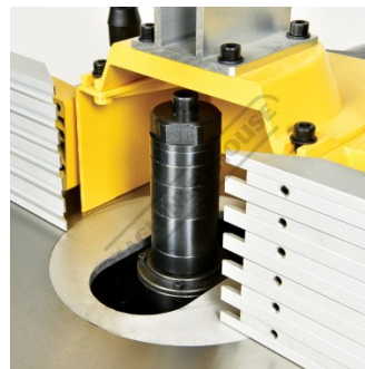
Tilting Arbor to 30 Degrees