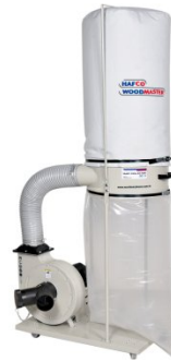
W394 Dust Collector