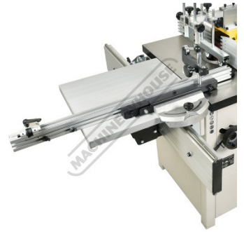
Includes Sliding Table