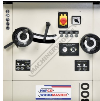
Spindle Adjustment Controls