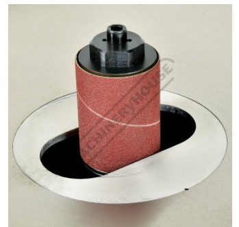
Sanding Sleeve Attachment