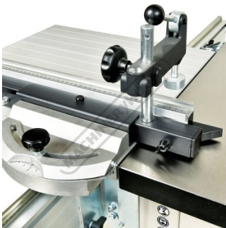
Includes Mitre Guide