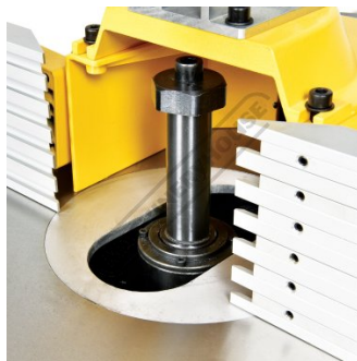
30mm Cutter Head