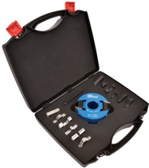
W647 40mm Multi Profile Spindle Cutter Head Set