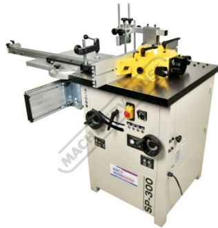
Sliding Table with Mitre Guide and Top Clamp