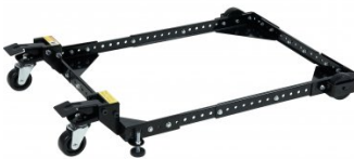
W930 Mobile Base