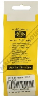
Packaging Rear View