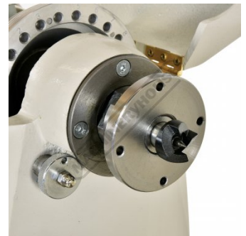
Main Spindle with Drive Spur