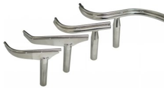
W295 Curved Tool Rest Set