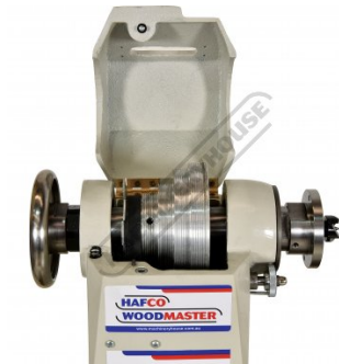
Flip Up Guard for Quick Belt Speed Change