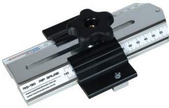
W311 Ripping Gauge