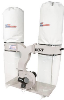
W329 Dust Collector