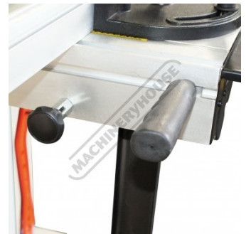
Sliding Table Lock