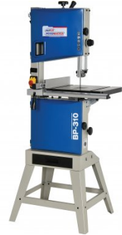
W952 Wood Band Saw