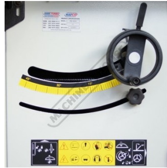
Tilt Gauge 45degrees And Blade Height Adjustment Hand Wheel