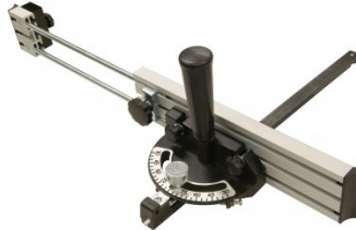
W308 Mitre Gauge & Fence