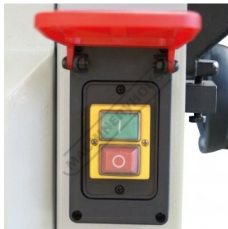
Safety Stop Switch Open