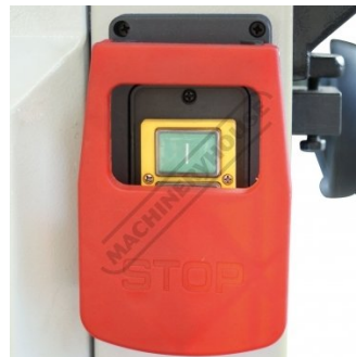
Safety Stop Switch