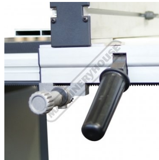
Micro Adjustment Rip Fence