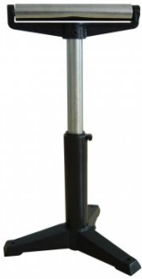
W3434 Roller Stand