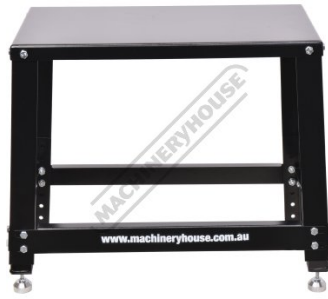
Front View Lowest Height