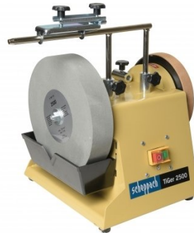
W868 Wetstone Grinder