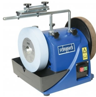
W859 Wetstone Grinder