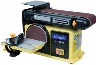
L105 Belt & Disc Linisher Sander