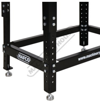
Adjustable Height Legs