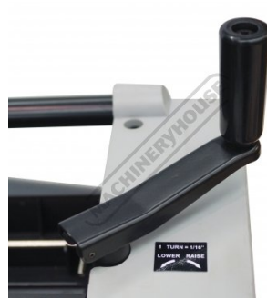
Height Adjustment Handle