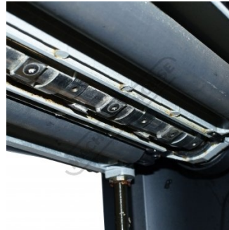
Spiral Cutter Head