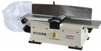
W817 Carbide Inserts for Spiral Cutter Heads on Thicknesser