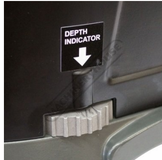
Pre-Set Depth Stop Dial