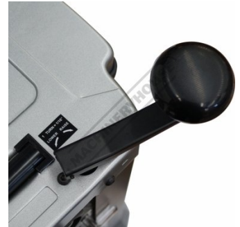
Height Adjustment Handle