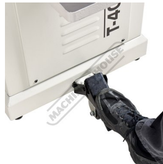
Moveable on Wheels