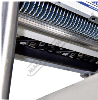
Five Helical Cutter Head With 80 Carbide Inserts