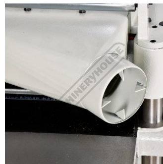
100mm Dust Outlet