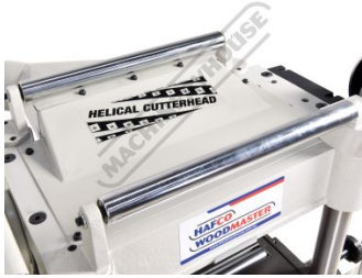
Top Rollers for Returning Material