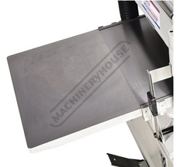
Cast Iron Infeed and Outfeed Tables