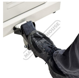
Moveable on Wheels