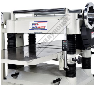
Heavy Duty 4 Post Design