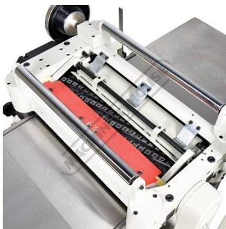
Six Spiral Cutter Head Top View