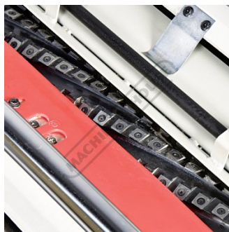
Six Spiral Cutter Head Top View Close Up