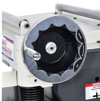
Height Adjustment Hand Wheel