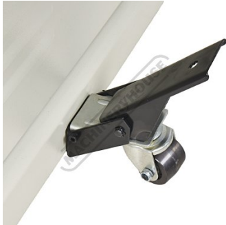
Lever Action Front Wheel