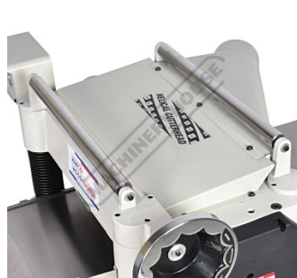
Top Rollers for Returning Material