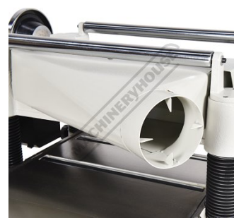
100mm Dust Outlet