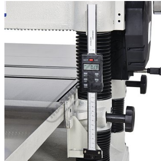
Digital Height Gauge