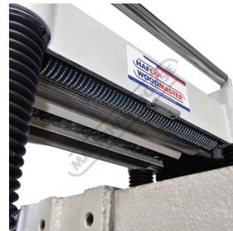
Anti Kick Back Fingers