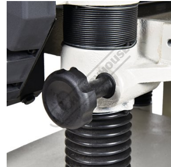
Table Lock Handle