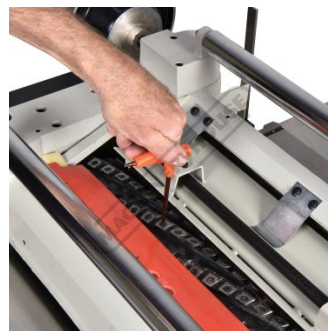
Six Spiral Cutter Head Changing Insert