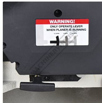
2 Speed Feed Gearbox