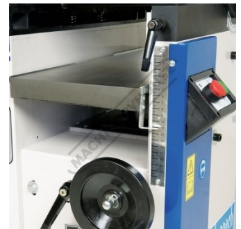
Thicknesser Table Height Adjustment Scale