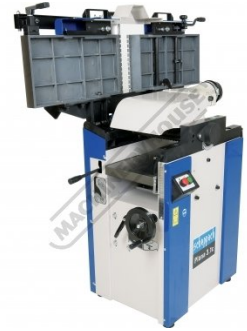
Set-Up For Thicknesser Left View