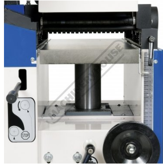
Heavy Duty Central Column Table Support