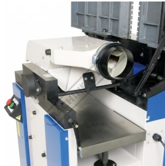
Dust Hood Outlet Shown in Thicknesser Mode