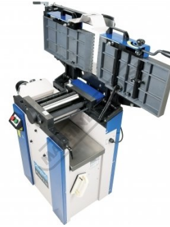
Quick and Easy Table Tilt System