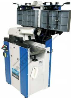
Set-Up For Thicknesser Right View