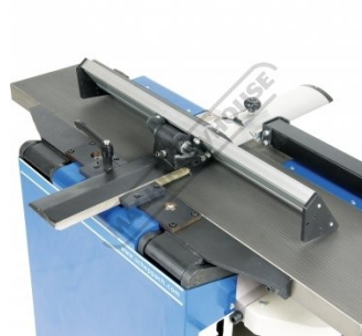
Fence Set-Up at 45 Degrees - Rear View