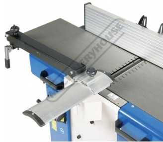
Adjustable Blade Guard Set