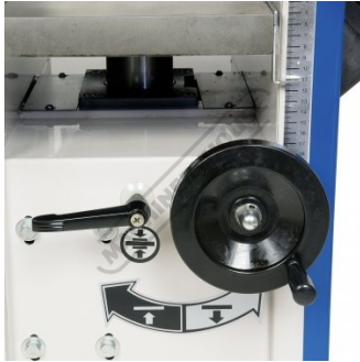
Table Height Adjustment Wheel & Lock Lever