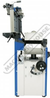
Set-Up For Thicknesser Side View