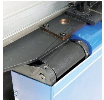
Heavy Duty Planer Table Hinges