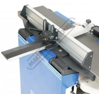
Fence Adjustment Locks