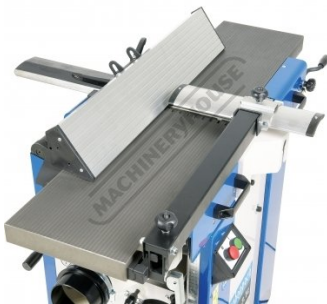
Fence Tilts to 45 Degrees