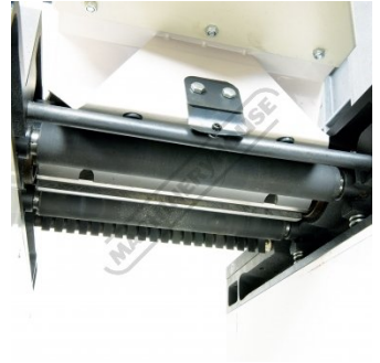
Unique Vulcanised Rubber Feed Rollers