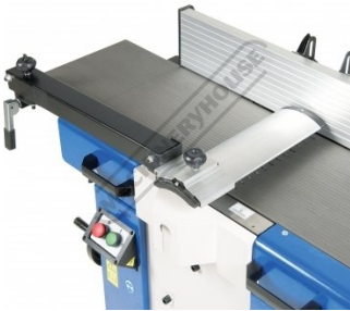
Adjustable Blade Guard