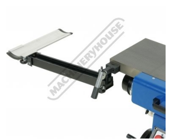
Flip Over Blade Guard