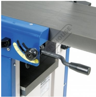
Table Height Adjustment Handle