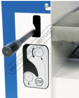
Roller Feed Engagement Lever