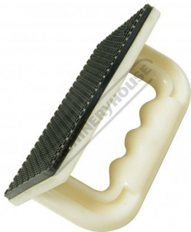
Includes Material Push Paddle