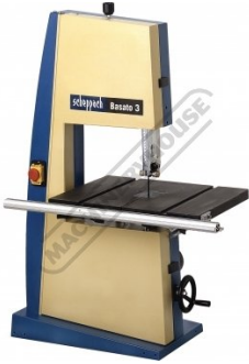
Basato 3 Tophalf