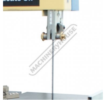
Twin 3 roller precision blade guides ensure precise cuts