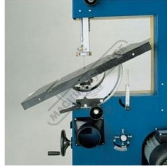
Large cast iron table with swivel capacity of -17deg to +45deg enhances versatility