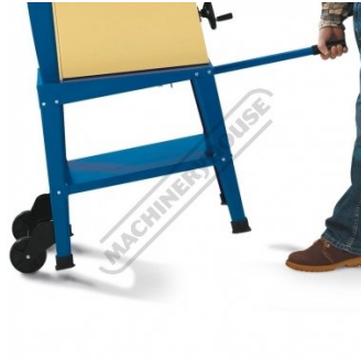
The new base unit with standard wheel base