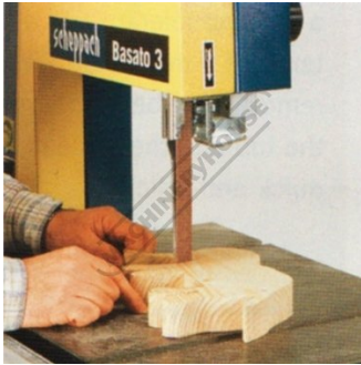
Unique variable speed drive system 370 750min