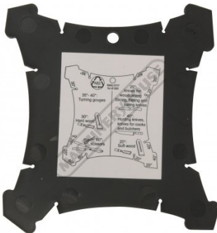
Angle Setting Jig