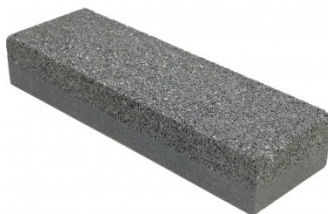
W8637 Angle Guide - 200mm