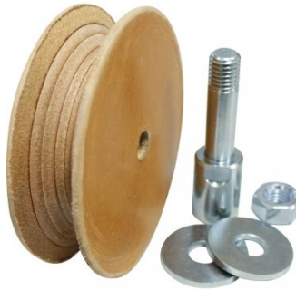
W8632 Leather Honing Disc