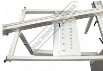
Table Mitre Guide