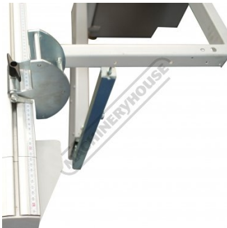
Flip Over Stop