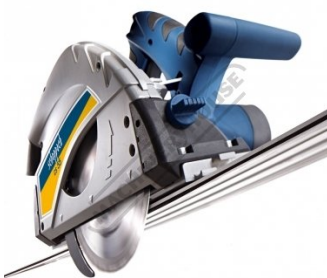
Bottom View - Shown with Optional Rail