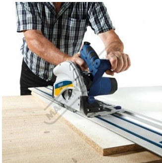
Achieve cuts usually performed on a panel sizing table saw - Shown with Optional Rail