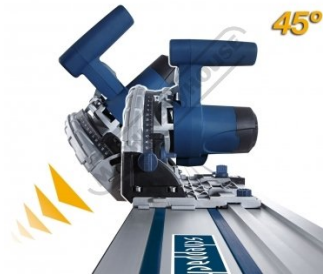
Mitre cuts with stepless angle adjustment 0 to 45 Degree angle adjustment