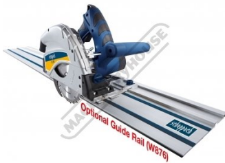
Shown with Optional Guide Rail