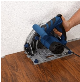
Ideal for edging up to 15.5mm from the wall