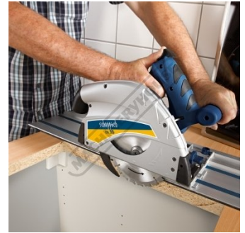
Perfect for kitchen worktops - Shown with Optional Rail