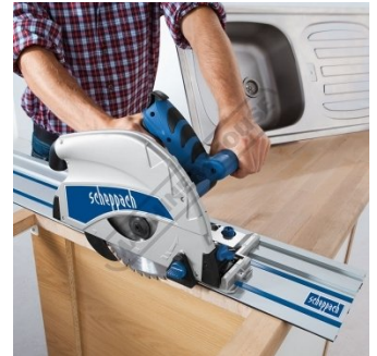
Perfect For Kitchen Bench Tops - Shown with Optional Guide Rail