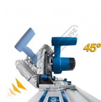
Mitre cuts with stepless angle adjustment 0 to 45 Degree angle adjustment