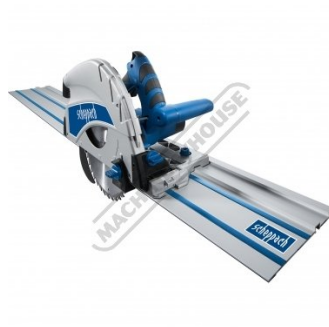
Shown with Optional Guide Rail