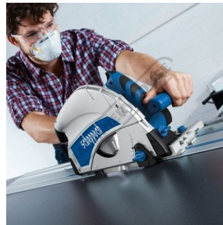
Shown Plunge Cutting