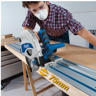
75mm Depth of Cut - Shown with Optional Guide Rail