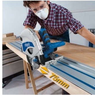
75mm Depth of Cut