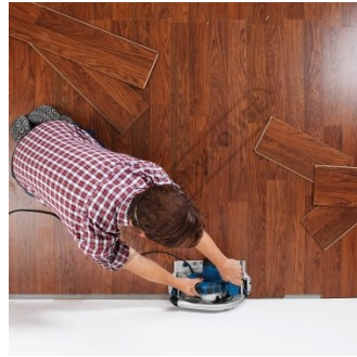
Ideal for edging up to 17mm from the wall