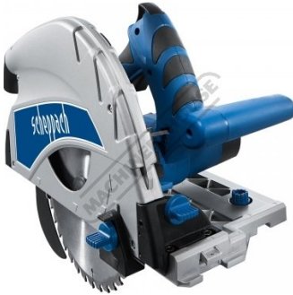
Circular Plunge Saw