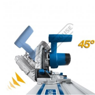
Mitre cuts with stepless angle adjustment 0 to 45 Degree angle adjustment