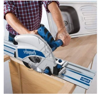
Perfect For Kitchen Benchtops