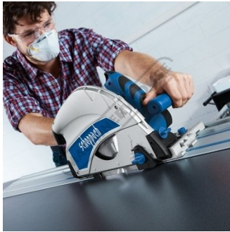
Shown Plunge Cutting