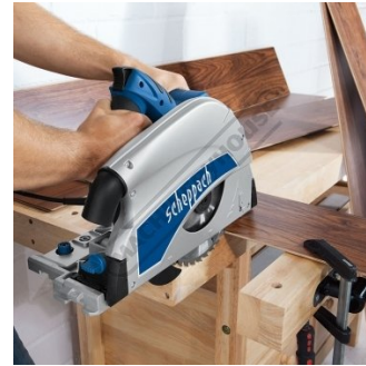
Cuts Solid Natural Timber Chipboards Plywood and MDF