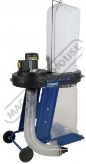
Right Rear View