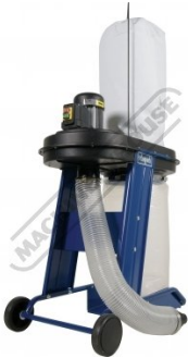
Rear Low View