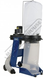
Left Front View