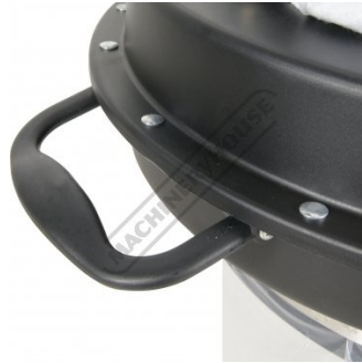
Handle For Easy Manoeuvrability