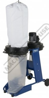
Front Right View