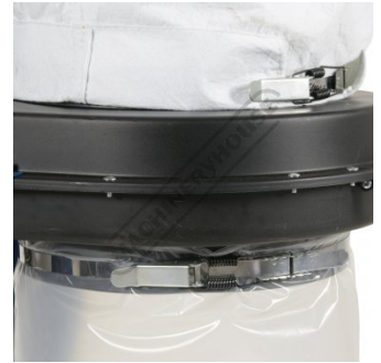
Quick Action Clamps