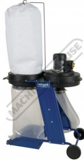
Left Rear View