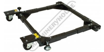
Square Minimum Size 580 x 580mm