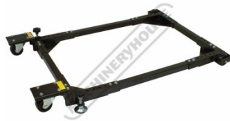
Rectangle 580 x 850mm Shown