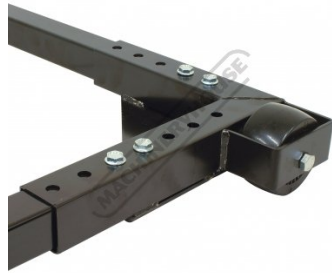
2 x Fixed Wheels