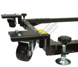
2 x Swivel Wheels with Adjustable Stops