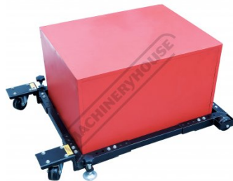
Shown with Box