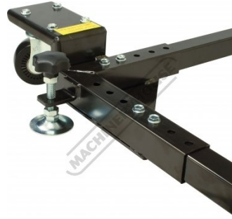
Adjustable Length Frame