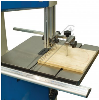
Shown with Optional Circle Cutting Attachment