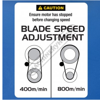
Belt Speed Diagram