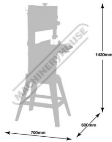
Minimum Floor Space Required