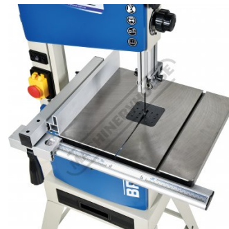
Cast Iron Table with T Slot