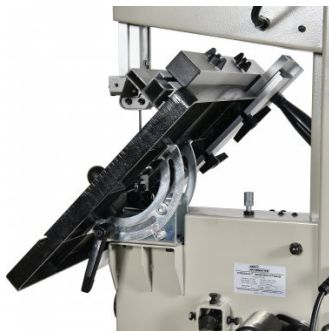
Tilt Table Adjustment