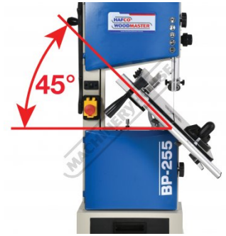
Cast Iron Tilt Table to 45 Degrees