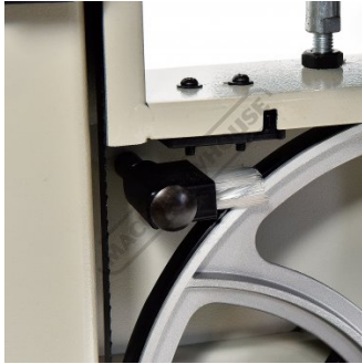
Wheel Cleaning Brush