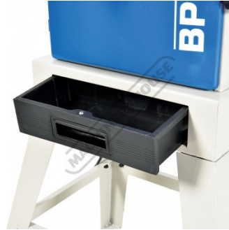
Dust collection Tray