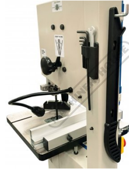
Push Stick and Tools