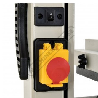
Safety Magnetic Switch and Light Switch