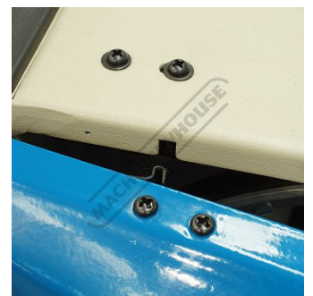
Blade Guard Micro Switch