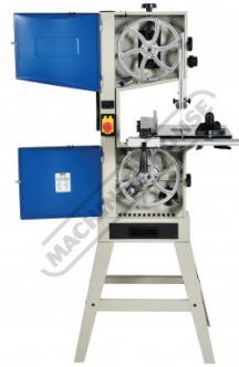
Easy Access for Blade Change