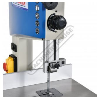
Blade Support Adjustment