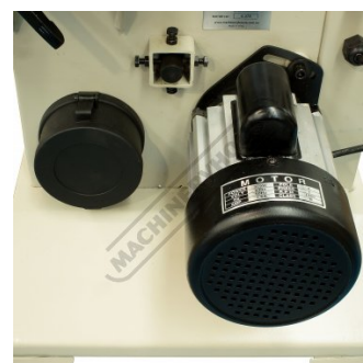
100mm Dust Port and Motor