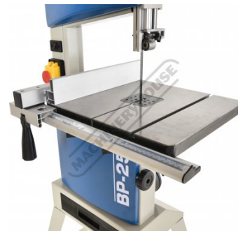
Sliding Rip Fence with High and Low Height Extrusion