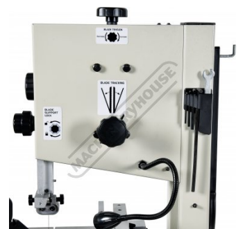
Blade Tension and Tracking Adjustments