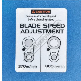
Blade Speed Adjustment