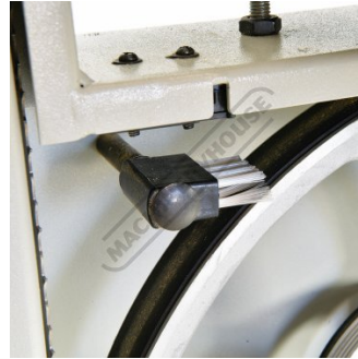
Wheel Cleaning Brush