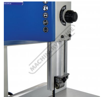
Blade Support Adjustment