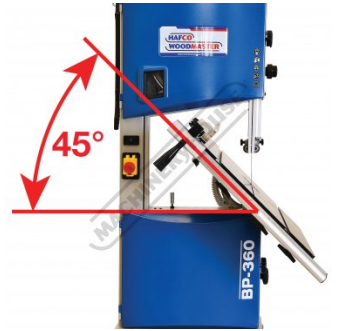
Cast Iron Tilt Table to 45 Degrees