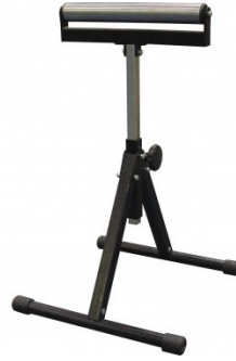
W343A Roller Stand