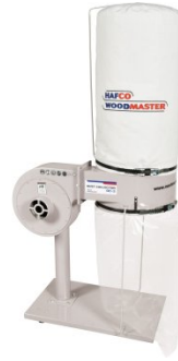
W332 Dust Collector