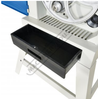
Dust collection Tray