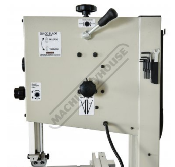
Blade Tension and Tracking Adjustments