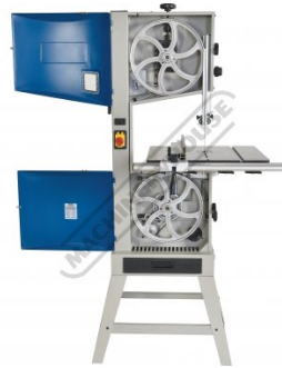
Easy Access for Blade Change