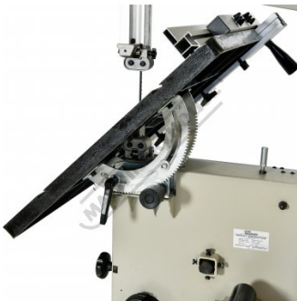
Tilt Table Adjustment