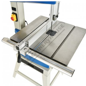
Sliding Rip Fence with High and Low Height Extrusion