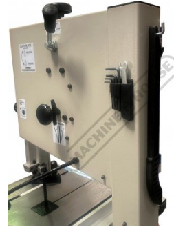
Push Stick and Tools