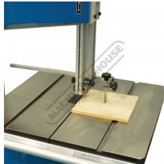
Shown with Optional Circle Cutting Attachment