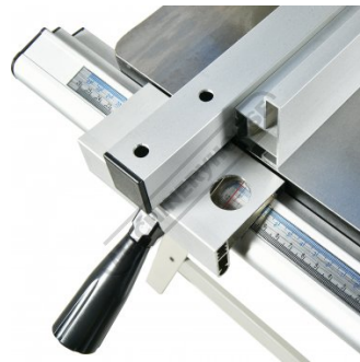
Fence with Quick Action Lock and Sight Glass