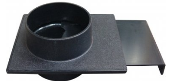
W335 Blast Gate