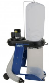
W886 Dust Collector