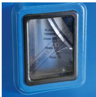
Blade Tension Scale