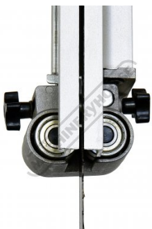
Ball Bearing Blade Guides