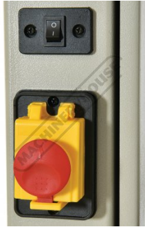
Safety Magnetic Switch and Light Switch