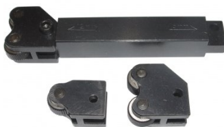
L076 Knurling Tool Holder Kit