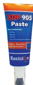
S075 Cutting Tool Lubricant Paste - 200g