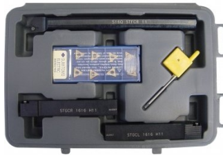
L451 Lathe Turning Tool Kit - 3 piece Insert Type