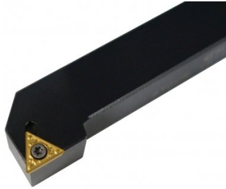
L017 Right Hand Turning Tool Holder