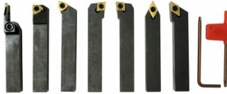
L0077 Lathe Turning Tool Kit - 7 piece Insert Type