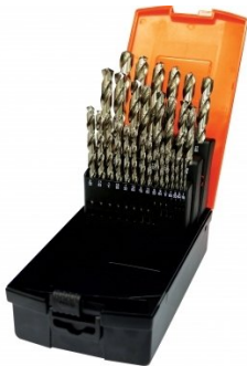
D1282 Imperial 135° Precision HSS Drill Set - 29 Piece