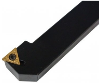
L018 Left Hand Turning Tool Holder