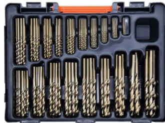
D126 Metric 135° Precision HSS Drill Set - 170 Pieces