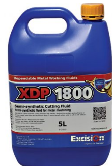
S090 Soluble Metal Cutting Fluid - 5 Litre