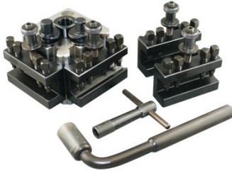
L295 Quick Change Toolpost