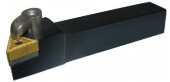
L044 Right Hand Turning Tool Holder