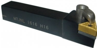
L045 Left Hand Turning Tool Holder