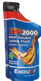
S090A Soluble Metal Cutting Fluid - 1 Litre