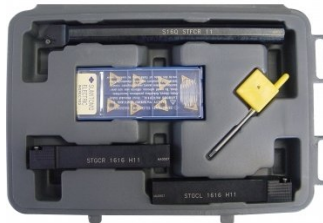
L451 Lathe Turning Tool Kit - 3 piece Insert Type