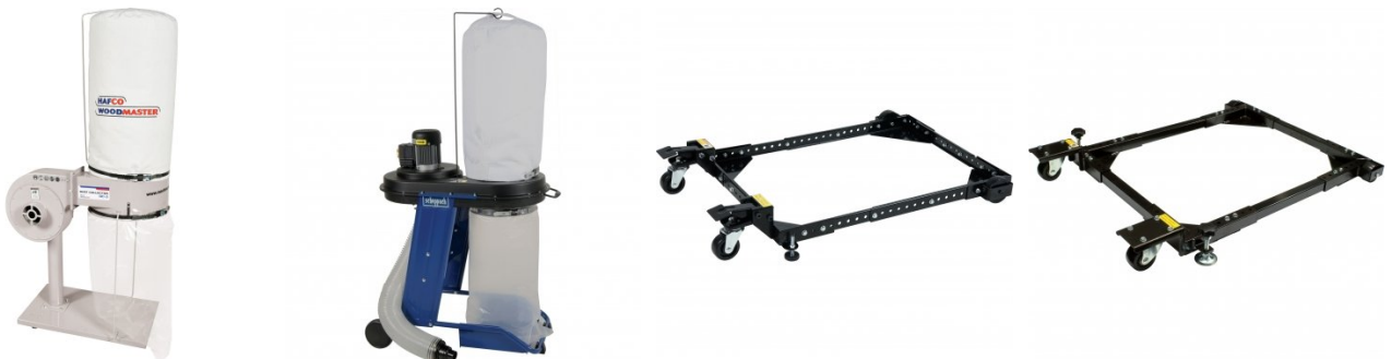
W931 Mobile Base - Heavy Duty