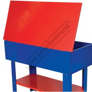
Piano Hinge Lid