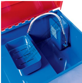
Recirculating Motor Flexible Hose