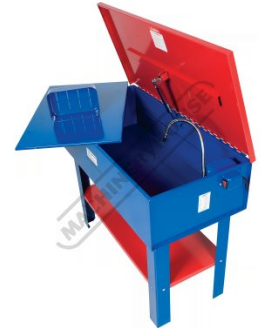
Removable Shelf Small Parts Wash Bucket