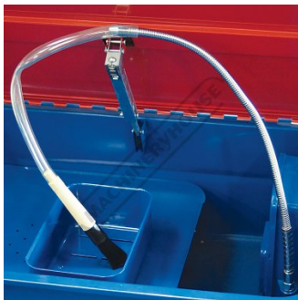
Shown With Optional Brush A376