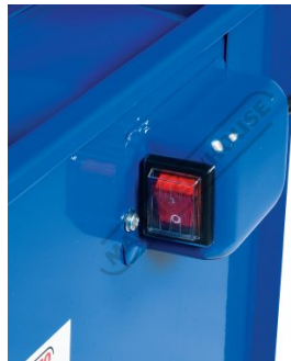
ON OFF Switch