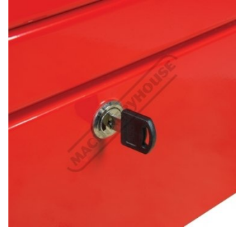
Key Lock Drawer