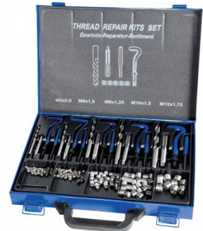
T100 Metric Thread Repair Kit - 130 Piece