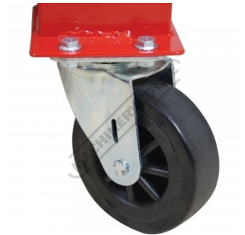
2 x Swivel Castor Wheels