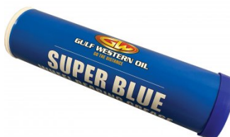
G057 Super Blue Complex Grease Cartridge