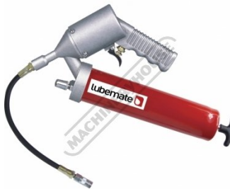
G074 Air Operated Grease Gun