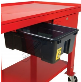
Removable Drain Bucket