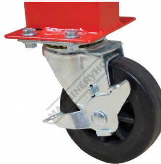
2 x Swivel-Brake Castor Wheels