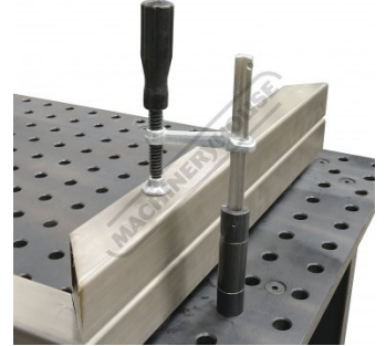
Shown Screwed into Optional Threaded Riser and Adaptor