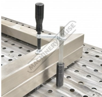
Shown Screwed into Optional Threaded Riser